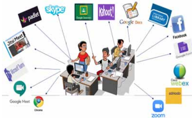
Figure 1. ICT tools used in teaching and learning

Library, Cobo Card, Canva, guru, read write think, ED puzzle, Kahoot, go noodle learn click, Google form, YouTube, and others.