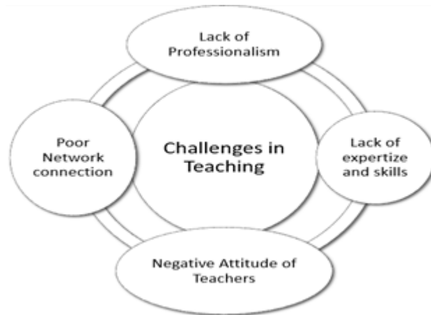
Figure 3. Challenges in teaching amid Covid-19 pandemic

Online teaching was the subject of a SWOT (Strength, weaknesses, Opportunities, and threats) study by Dhawan (2020) in the situation when college were forced to go online. The paper makes the case that the biggest strength of online learning is its adaptability and accessibility, which offers chances for pedagogical innovation and skills development to the higher education sector. The weakness of online teaching, however, are identified as a technological challenge, time management issues, and lack of readiness for online learning. The issues may come with a variety of difficulties, including the digital divide, inequalities between different groups, and lack of supportive relationships.