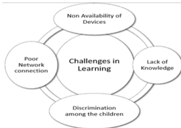
Figure 2. Challenges in learning amid Covid-19 pandemic

When millions of students are forced to stay at home due to lockdown and social isolation, education via ICT tools looks to be the only way to ensure that education at schools, colleges, and institutions is not disrupted. Around 1.72 billion students around the world have been affected by school closures, with around 32 crores students in India alone (UNESCO, 2020). During the pandemic, using ICT in education is a top priority. Learning using ICT tools has a variety of consequences to everyone from young children to adults at all levels, including individuals with special needs. So technological adaptation is considered as a panacea for learning at all levels. However, lot of difficulties and challenges have been faced by students while using ICT for learning purposes. Despite the advantages of maintaining the physical distance in e-learning, there are a number of drawbacks and difficulties,