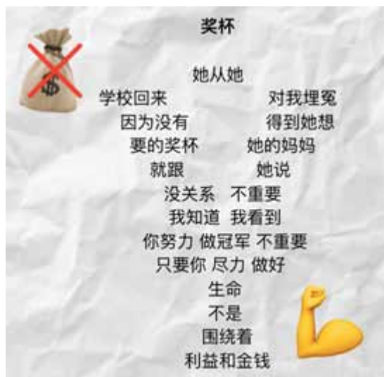
Figure 3. Visual shape poetry application

poetry) but about the experience towards a higher goal and a better self.” The student’s poetry has also reminded the teacher that “the multiliteracies projects are not all about the final product. The experience of designing and redesigning is the core construct”. Through integrating the DMC project, the teacher experienced a co-inquiry of art-based learning through exploring different modes, such as linguistics, visual and aural, and integrated them to create a more holistic and impactful product.