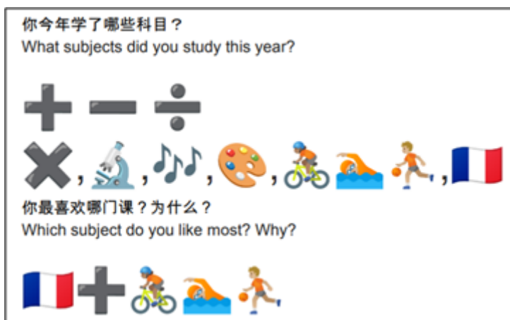
Figure 1. Emoji encoding process

The majority of students in this DMC project found the activity engaging and inspiring. They also found that they gained a better understanding of both Emoji as a semiotic communication system and the Chinese text as a multimodal writing system after sharing their learning experiences with their teacher after class. Their comprehension was also enhanced after listening to their classmates’ stories. Through this DMC project, the teacher successfully integrated the concept of multiliteracies into her teaching and guided her students through a comfortable transition from paper-based learning to screen-based multimodal learning at the early stage of Chinese learning.