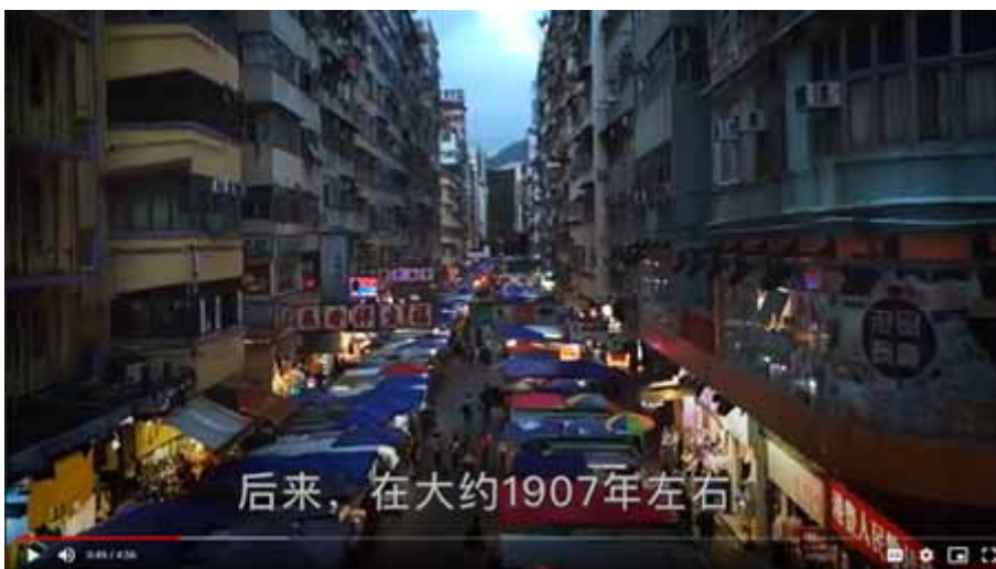
Figure 4. Collaborative video essay example – “Hong Kong’s Iconic Neon Sign

This DMC project shows that multimodal texts convey meaning through a combination of meaning-making elements that draw upon several semiotic systems. Language is not always the dominant element, and each has a unique role in contributing to the overall meaning of texts (Anstey & Bull, 2019). Hence, as producers of the multimodal texts, both teachers and students need to understand the codes and conventions of different semiotic systems and how they interact with each other. More importantly, both teachers and students need to deploy such knowledge creatively and critically to achieve the communicative purpose. By systematically introducing multimodal texts as legitimate learning resources into language teaching, teachers can delve into the social consciousness of the larger society and global culture, informing students and lighting a fire under them to push them to enact positive change in the world.