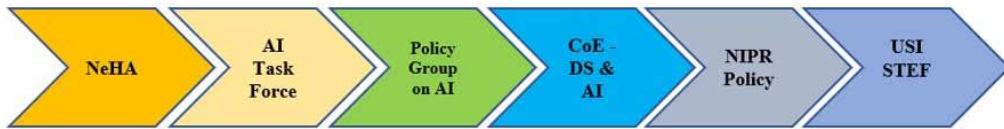
Figure 1. Initiative