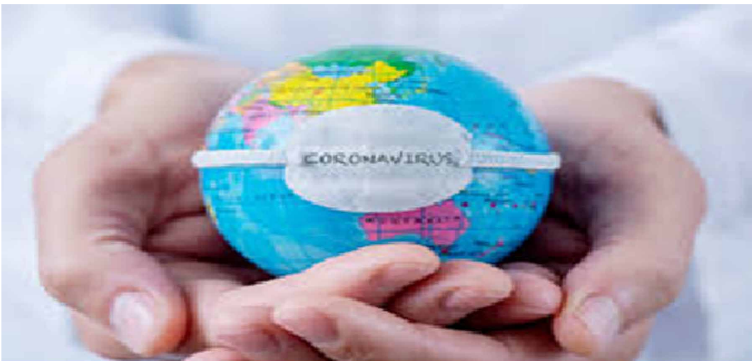
Figure 1. Coronavirus COVID-19 in Worldwide

We keep up that the advanced separation is currently not just about computerized innovation introduction or use. Still, it deals with the new technology use and engagement for better behaviour intention. Anyway, this study focusses on showing a literature review on being in a situation to join advanced science into massive social exercises and benefitting from it (Zhu et al., 2020). The youthful innovation needs to take a hopeful and refined technique closer to mechanical design, for example, they should impartially investigate how it might and should be, and not take conveyance of how it is at present only. To do this, the more undergraduate wants to pick up abilities and intensity