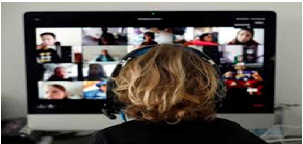
Figure 2. Emerging technologies under COVID -19

The study tries to comprehensive review to clarify the achievements of student learning by e-learning to overcome the coronavirus COVID-19 pandemic as a requirement for the university's standards and recommendations to be followed during the process (Porpiglia et al., 2020; Tawafak & Mohammed, 2018; Wilby et al., 2017). What is the effect of many factors on the mechanism of updating curriculums, examination methods, and student feedback (Oman Academic Accreditation Authority, 2010; Tawafak & Mohammed, 2018) within standards? The theoretical work consists of teaching and learning processes. This study tries to achieve the following objective: "To determine the most application used in blended learning applications that has many e-learning characteristics."