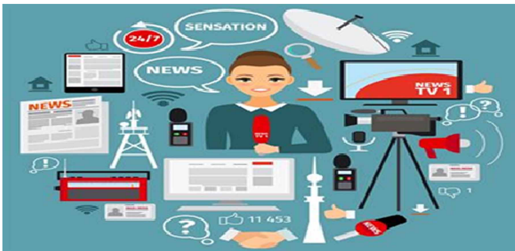
Figure 3. The impact and role of mass media with COVID-19 pandemic

This research has some secondary research questions: