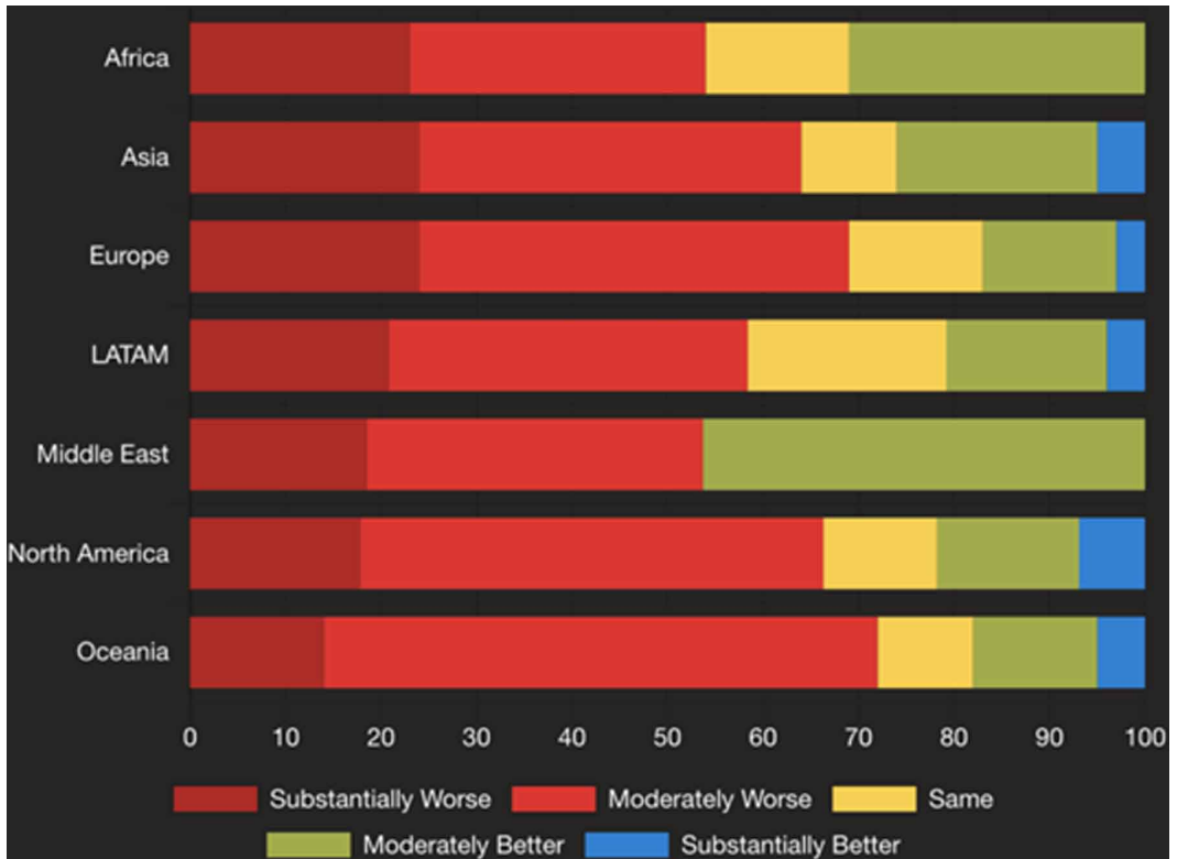
Figure 6. Expected impacts of COVID-19 in education sectors

point could implement by proposing a computational model of web-based survey research which is accepted for researching some populations connected between features and TEL usability (Figure 6).