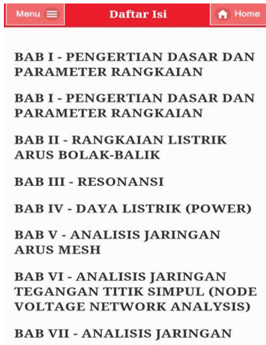
Figure 3. Display of electric circuit course menu