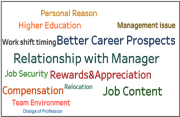
Figure 1. Word Cloud generated based on the data

exit interview data is the exit reasons employees mentioned on their last day at work. The data obtained from line manager interview and human resource business partner (HRBP) interview are the reasons specified by the employees during the notice period. The telephonic interview data pertains to the data collected from the employees after a specific time frame (more than six months) once they have left the organization. By doing a simple radar chart (Kalonias et al., 2013) visualization technique, the chart clearly depicts that there exist deviations in the reasons mentioned by the employees during the four different interview modes. Figure 2 describes that the radar chart shows a greater deviation in exit reasons mentioned by the employees especially during the telephonic interview mode. On comparing the reasons mentioned by employees during the four different interview processes, a drastic difference is seen with the results of telephonic interview with HRBP and line manager interview. This indicates that employees tend to open up only once they have moved out of the organization. This also links to the finding that the employee's relationship with manager and management is an important HR factor to be considered. The difference in the ratings provided by the ex-employees of the organization under study for their past and present company in terms of these HR factors has been taken with 5-point Likert Scale.