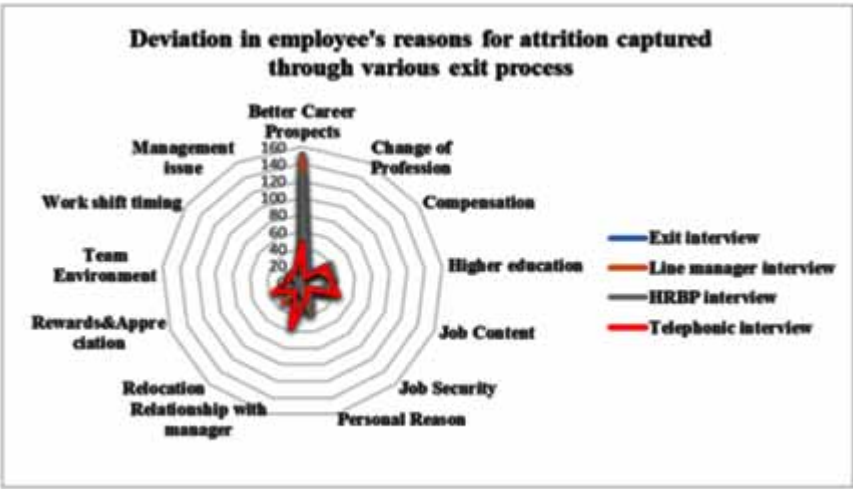
Figure 2. Radar Chart shows a greater deviation in exit reasons

exit interview data is the exit reasons employees mentioned on their last day at work. The data obtained from line manager interview and human resource business partner (HRBP) interview are the reasons specified by the employees during the notice period. The telephonic interview data pertains to the data collected from the employees after a specific time frame (more than six months) once they have left the organization. By doing a simple radar chart (Kalonias et al., 2013) visualization technique, the chart clearly depicts that there exist deviations in the reasons mentioned by the employees during the four different interview modes. Figure 2 describes that the radar chart shows a greater deviation in exit reasons mentioned by the employees especially during the telephonic interview mode. On comparing the reasons mentioned by employees during the four different interview processes, a drastic difference is seen with the results of telephonic interview with HRBP and line manager interview. This indicates that employees tend to open up only once they have moved out of the organization. This also links to the finding that the employee's relationship with manager and management is an important HR factor to be considered. The difference in the ratings provided by the ex-employees of the organization under study for their past and present company in terms of these HR factors has been taken with 5-point Likert Scale.