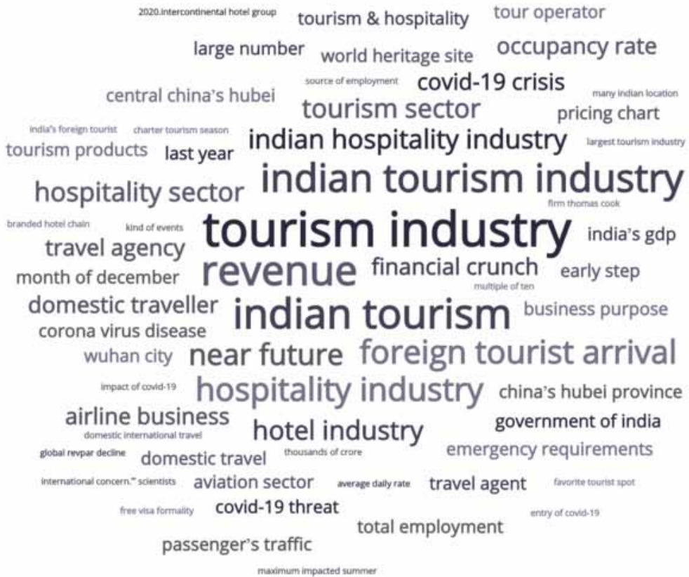
Figure 9. Keywords for the Tourism Industry

of building materials is halted from china. The cost of developing the building is increased. Leasing or renting of office area reduced by 50 percent in large cities.