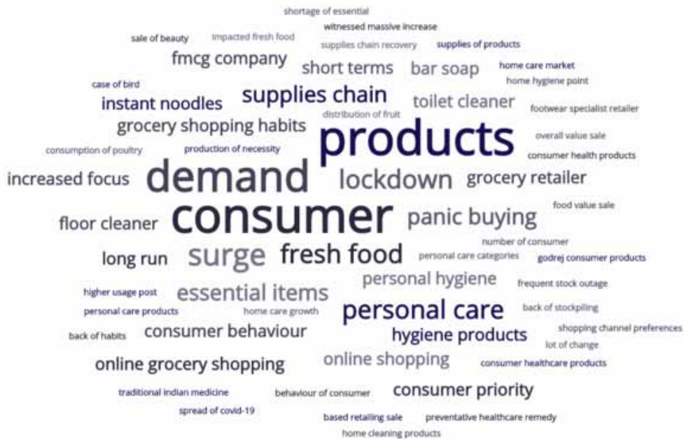
Figure 14. Keywords for Fast Moving Consumer Goods