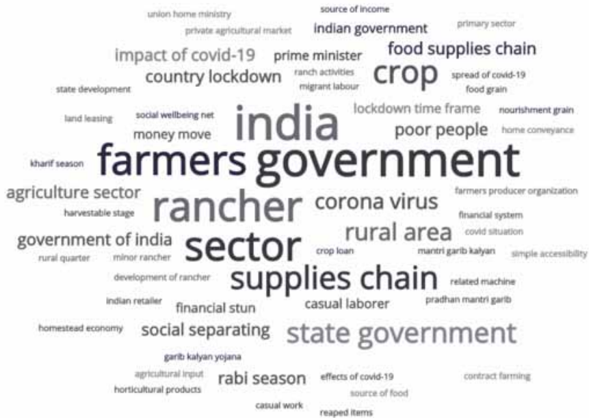
Figure 1. Keywords for Agriculture

The nation or countries that import oil gets it at a lower price whereas the nations that export the oil must look at another alternative to earn profits. As a result of the Lockdown in India, the refiners reduced their oil production by 25-30 percent (Kar, 2020). Figure 2 exhibits that the word diesel is predominantly discussed by the various articles. Due to lockdown, the consumption of petroleum, oil, and gas, and aviation fuel decreased. The price of crude oil, global oil demand go downwards as the worldwide restrictions. Because of the pandemic, the least demand for oil was recorded for the first time in the world. The traveling restriction enables the government of the nations to improve the old roads and makes the new ones.