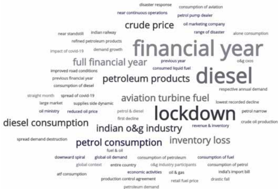
Figure 2. Keywords for Petroleum and Oil Industry

lockdown. Thousands of shrimp seeds and broodstock were destroyed in the course of the curfew (Soudamini and Mohapatra, 2020). Figure 3 indicates the lockdown as a result of the pandemic primarily impacted the supply chains of the east and west coast. The countries near the ocean such as Andhra Pradesh, West Bengal are mainly bear the consequences. The COVID-19 affected the exports of seafood to the United State of America. A shortage of migrant workers affects the packaging of the fish in the factories. There is a declining trend in the income of the fishers and consumption of fish.