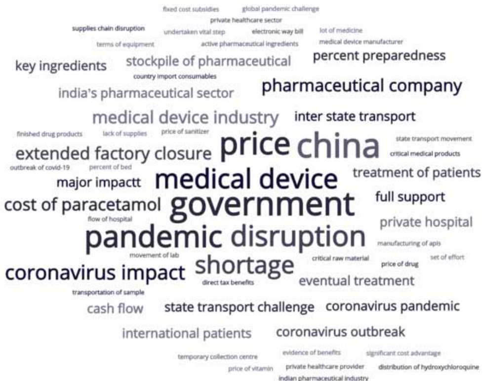
Figure 8. Keywords for Healthcare and Pharma Industry

Ramesh (2020) talks about that coronavirus has loaded the hospitals with two main burdens- 1) a decrease in international patients, surgeries 2) An increase in the number of staff, doctors, resources, proper safety in the hospitals. 60 percent of beds, patients, and 80 percent of the doctor along with resources, staff are involved in handling the COVID-19 patients. The coronavirus affected industry that provides devices or equipment used in hospitals. China exports gloves, bandages, syringes, medical devices, and instruments to India. But to coronavirus, this business is rigorously hit. Due to the shortage of supplies, the price of the pieces of equipment is increased. In the case of the Pharmaceutical industry, India exports high-quality drugs to other countries. As a result of global lockdown and trade restrictions, there is a 10-15 reduction in the profit generated from this sector. It is pictured in