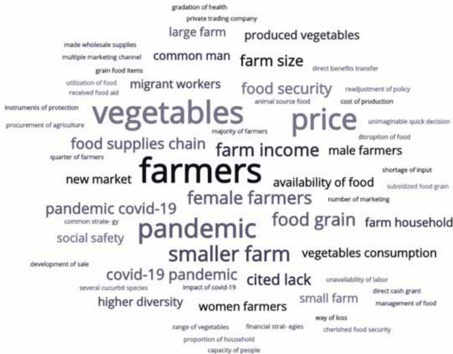
Figure 12. Keywords for Food Services