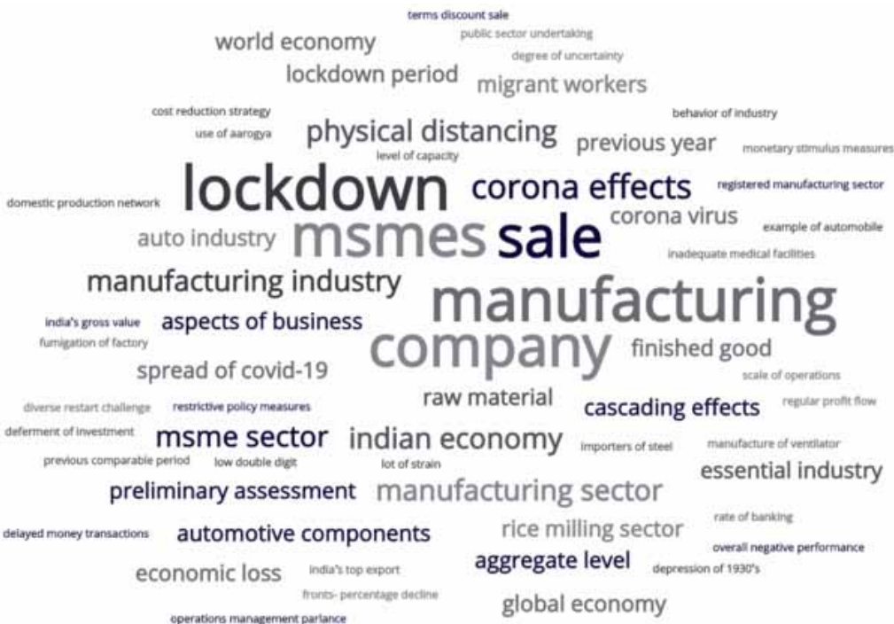
Figure 5. Keywords for Manufacturing Industry

The survey performed by the United Nations Industrial Development Organization (Berkel, 2020) depicts that the manufacturing industry halts excluding the rice milling industry due to COVID-19. Fluctuations in demand, the disordering of the supply chain, shortage of laborers, lack of semi-skilled workers, and relocation of the employees at different skill levels are the major reasons for ceasing