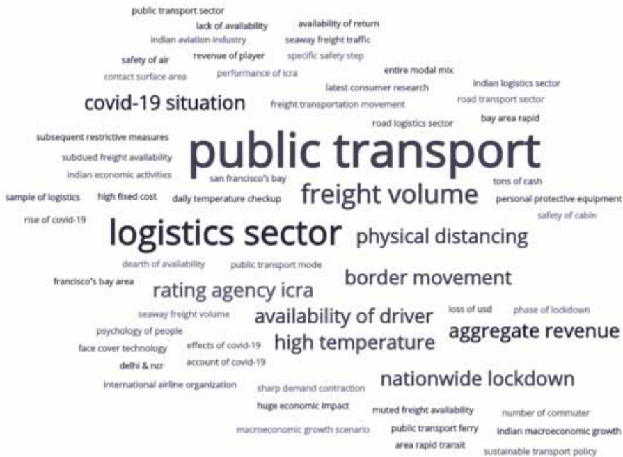
Figure 13. Keywords for Transportation Service