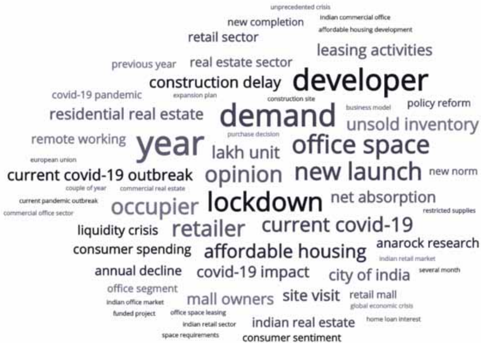
Figure 10. Keywords for Real Estate

As per the report of Gartner (PTI, 2020c), there is an 8 percent reduction in the money invested in information technology. There is 13.2, 15.1, 1.8, 2.6 percent falls in spending in data center system, devices, communication services, enterprise software. Department of Science and Technology-Science and Engineering Board (DST-SERB) under the Government of India has been working on five projects to handle coronavirus infection (Srinivasa, 2020). Figure 11 shows the words newspaper, information, and COVID-19 are primarily focus on the word cloud. Employees and journalists receive less pay. Revenue earned through advertising by the print media also dripped. From the infection fear, the newspaper circulation among the clients ceased. The customers prefer electronic media or web media to get major news. Researchers work on the neural network, machine learning, and artificial intelligence, deep learning technologies to find the cure for the COVID-19. They analyze the amino acid sequence and level of protein in various chemical compositions.