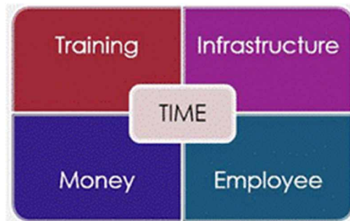
Figure 1. TIME Model

Brunei required a comprehensive package-intergrated approach to encounter many difficulties they encounter (Islam, Karim and Salleh, 2001).