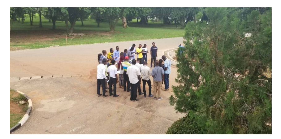
Figure 4. A group of the workshop participants using global positioning systems (GPS) for data collection

research areas identified with the faculty in the Department of Geography and Rural Development at KNUST is progressing after the project. A shared database has been created to be accessed by faculty and students for research articles to support research in the host university. The workshop participants continue to have access to the one-year ESRI ArcGIS software license to be renewable annually in collaboration with ESRI- California and Sam Houston State University. Faculty continue to publish in the International Journal for Applied Geospatial Research. Some of the challenges in executing the project objectives at the Host University included 1) fitting programs to already busy schedules, and 2) non-existence of GIS laboratory. These challenges the outcomes and methodology for this project can be duplicated in other African universities pursuing programs in geospatial technologies and related applications. CADFP also continues to assist African higher education institutions to build capacity to enhance curriculum and research through African scholars in the Diaspora.