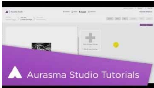
Figure 2. Aurasma application

time, this combination also encourages students to engage in the learning process because they are free to explore knowledge at their own pace.