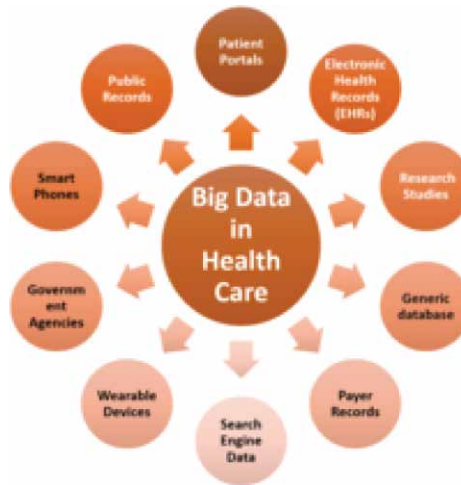
Figure 1. Insight of Big Data in healthcare