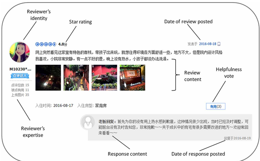
Figure 1. An online review with response

The previous study indicated that hotel's response is more effective for budget hotels than high-end hotels those have defined managerial response strategies (Lui et al., 2018). Thus, we selected 26 budget hotels in the ancient town Pingle in Chengdu as samples and collected 1705 records posted before 1st October 2016 using the LoalaSam v0.3.1 software, among which, 914 reviews are with a response. To furthest ensure that the subsequent visitors (users of the website) have been able to view both review and hotel's response, as well control the influence of response speed, we only employed the reviews which induced hotel's response in 24 hours after they were posted. After filtering out the extreme values, 637 reviews remain for final analysis.